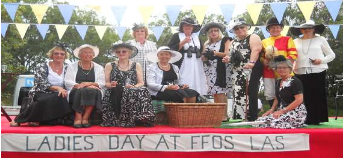
Best adult float: Ladies at Ffos Las (St Davids WI).