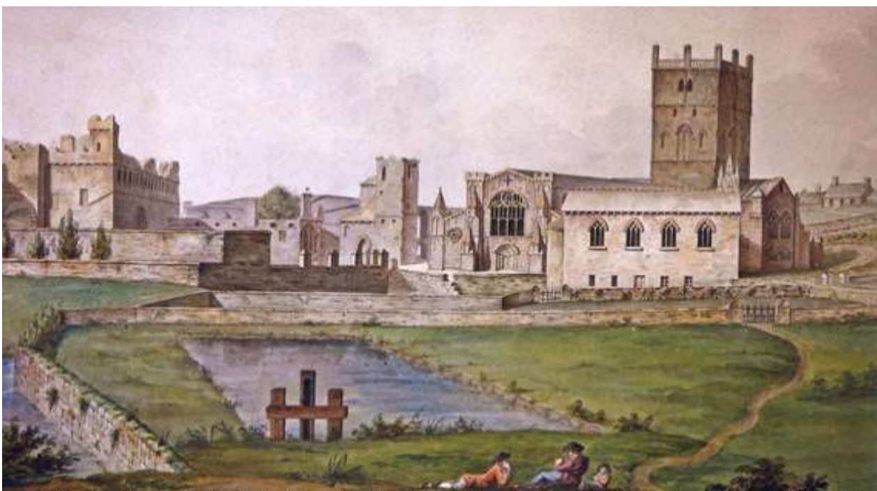
Cathedral from Merrivale Bridge showing Nash Chapter House (formerly Grammar School) Watercolour - Pugin c 1795

The drawings were over the years split up and largely forgotten. In the early years of the 21st Century they were reunited at Haverfordwest Library. Here the entire collection was photographed digitally by the National Library of Wales. The St. David's & Dewisland Historical Society, who were involved in the scheme, obtained a copy on disc of the collection, which included a couple of Pugin watercolours. Full sized prints were made; these have been displayed by the Society on a number of occasions.