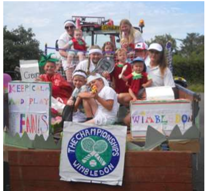
Best adult & child float: Wimbledon