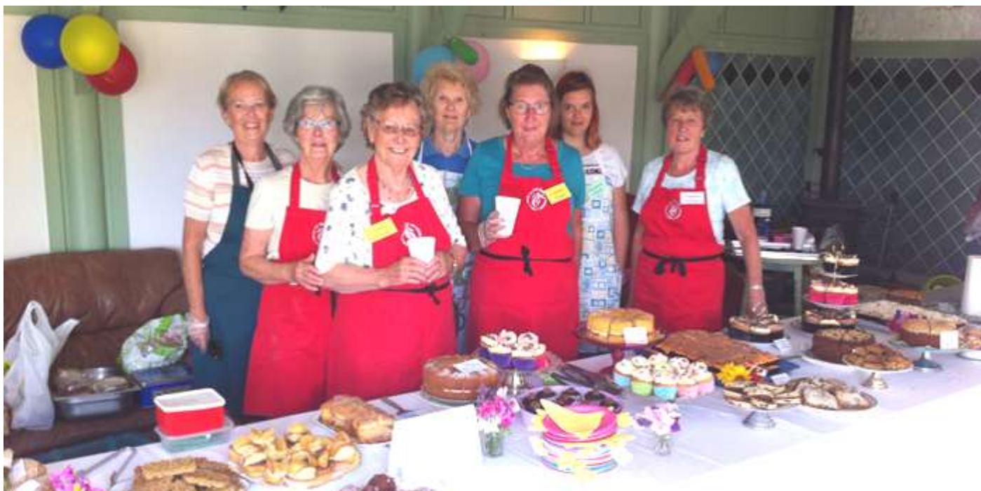
Serving teas at the refreshment stall at the Treginnis annual fete.