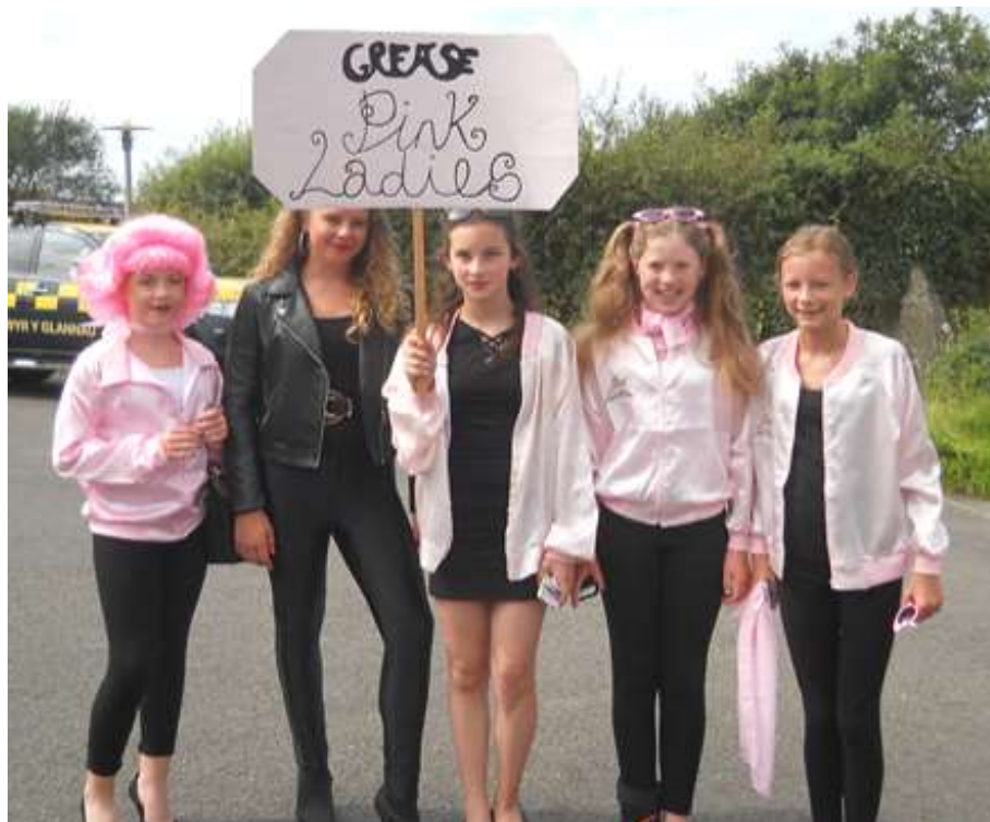
The glamorous Pink Ladies setting off on the procession.