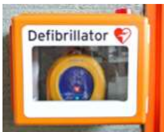
located on the wall of the Harbour Masters Hut.