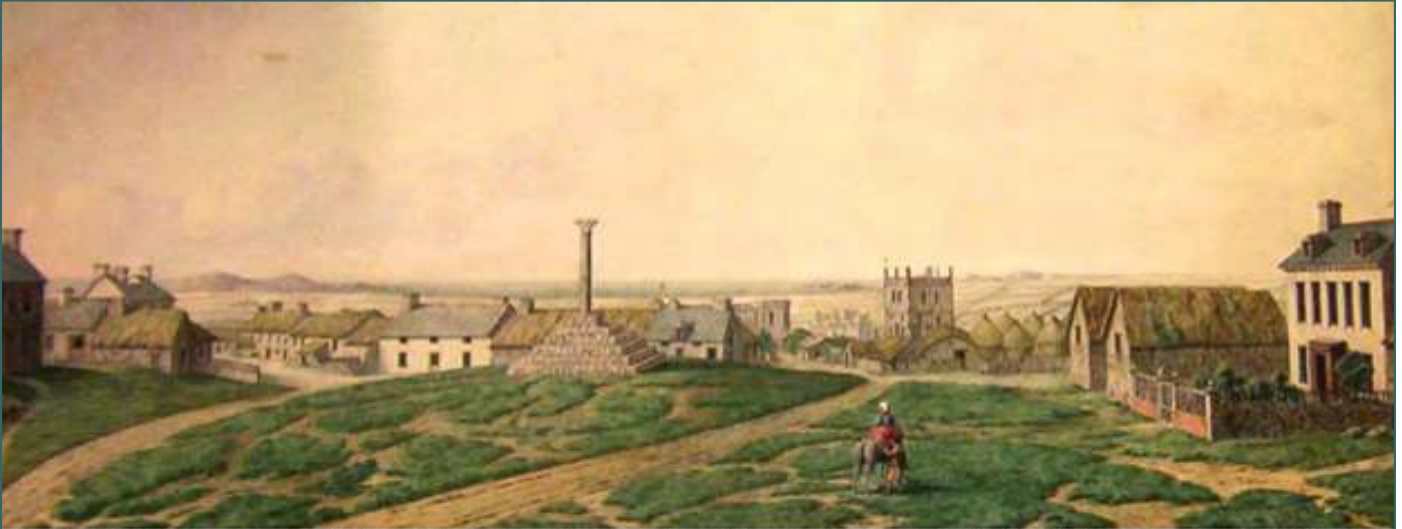
Cross Square, St. David's in late Eighteenth Century showing original column on Market Cross, Old Cross (rebuilt 1766) extreme right. Watercolour Pugin c 1795

Davies The cathedral as it exists today is largely the product of Gilbert Scott's Victorian Restoration. However, by the late eighteenth century, the building was already in a state of disrepair. The eastern chapels were largely unroofed, there were serious cracks in the Tower and the West Front was only supported by enormous timbers.